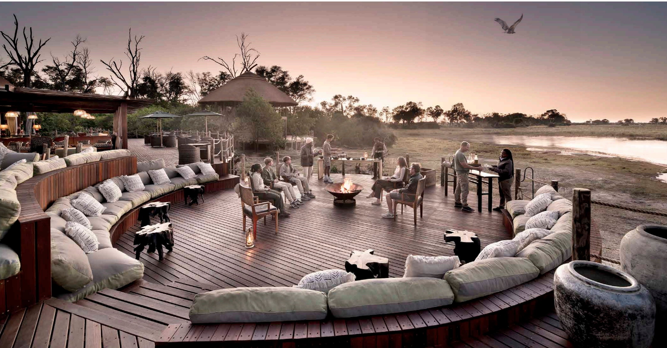
Sustainable luxury at the heart of the Okavango Delta, Botswana