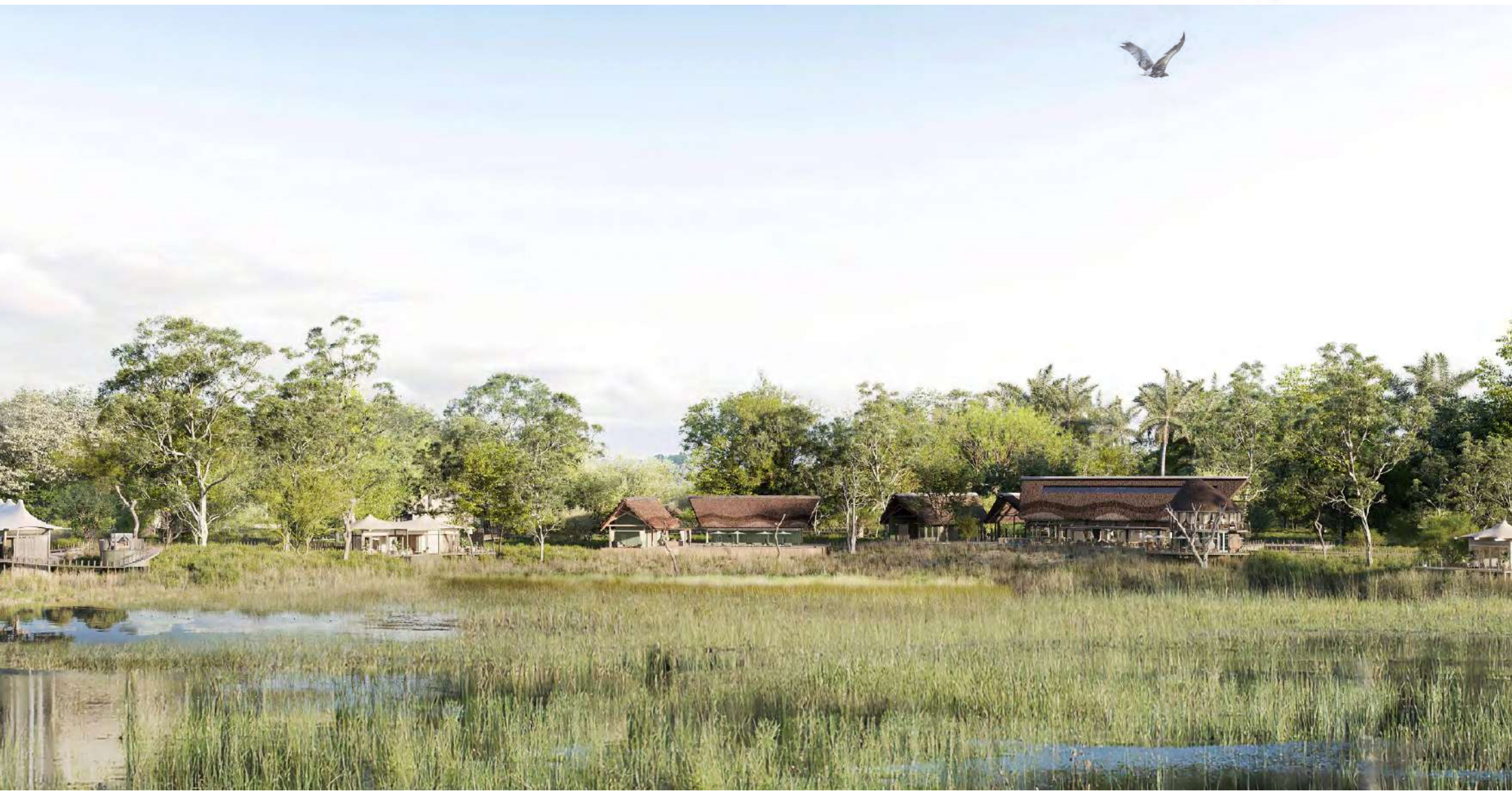
Sustainable luxury at the heart of the Okavango Delta, Botswana